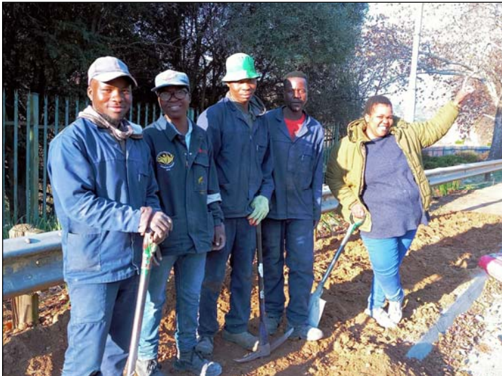
Above: The cheery workers who constructed the walkway.

The opening of the centre has been a widely anticipated event, and will be covered in more detail in the September edition of the Olive Branch. ☐