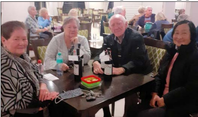
Above: The winners, Team Spellbound, who each received a bottle of Val di Terra wine.