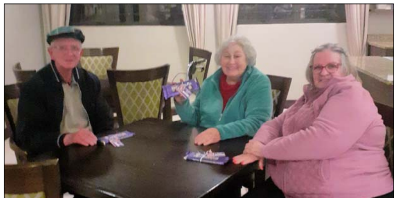
Above: Team The Skittles who came second, despite being only a three person team.