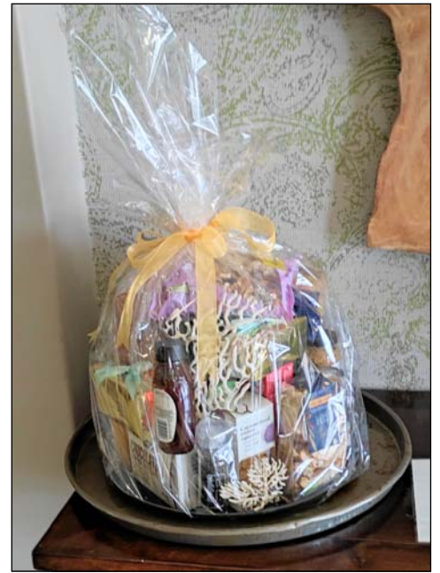
Above: This splendid hamper of goodies is being raffled by the Gardening Committee. Please support them by taking a ticket at Reception at R20 each.