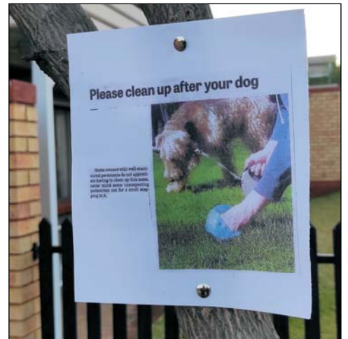
Above: Seen in the Village. It was put up by a rather desperate resident.

WHAT DO YOU CALL A ROW OF RABBITS HOPPING AWAY? A RECEDING HARE LINE.