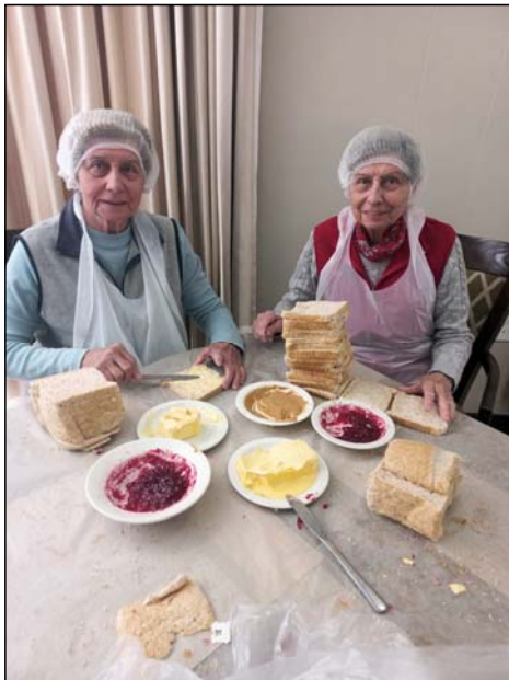
Above: Two busy bees.