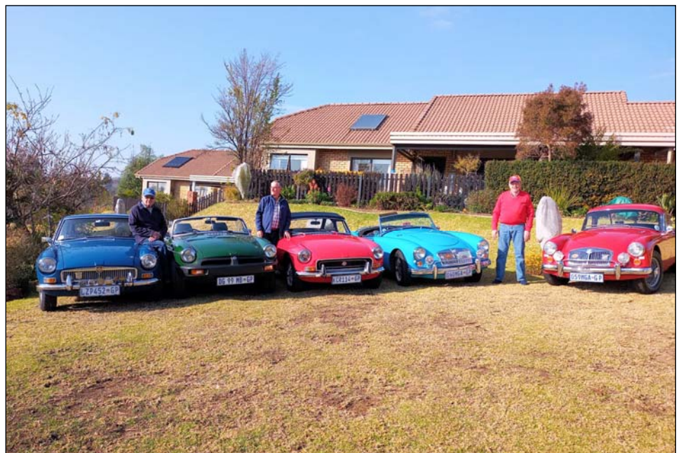
Above: The cars and their proud owners.