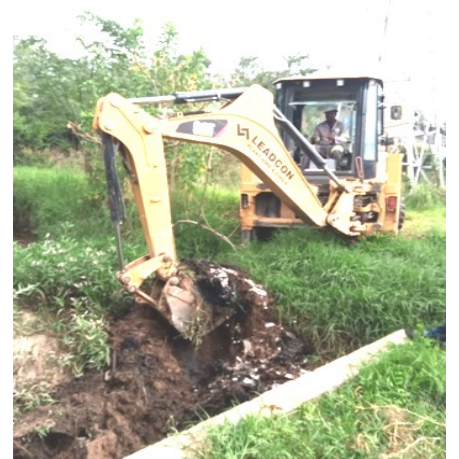
Clearing the culvert