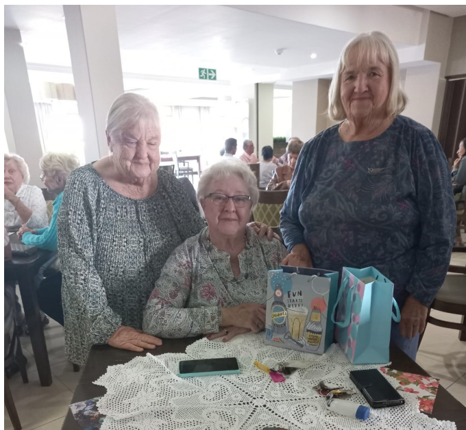
ORV residents enjoying conversation