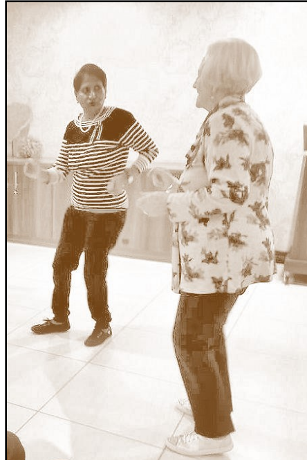
Residents enjoying the evening