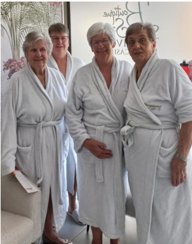
Four ORV ladies visited the Mangwanani African Spa for a bit of relaxation. They thoroughly enjoyed the pamper.