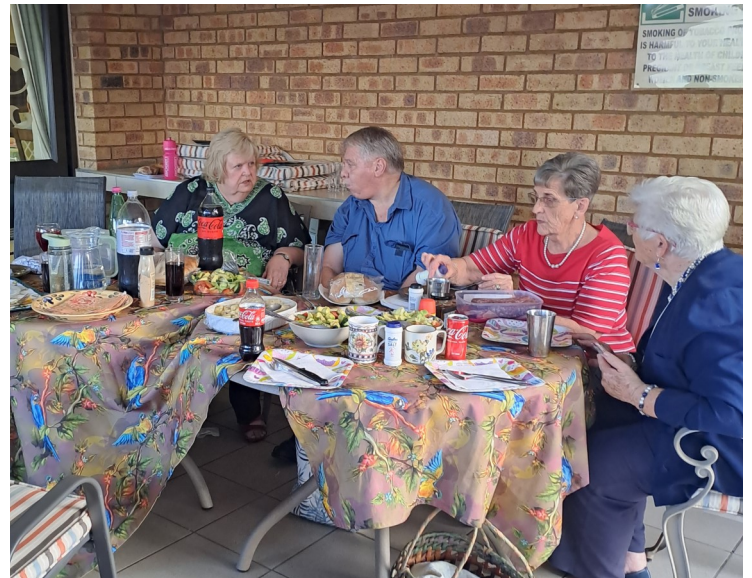
Residents enjoying their meal on the patio in style.