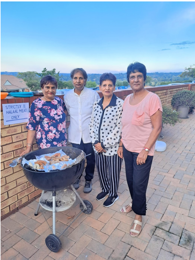
If there is one thing we know best, it's how to braai. These ladies show how it's done.