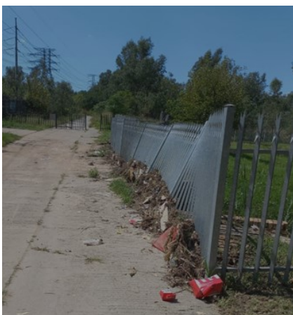
Damage to the Lima Street fence