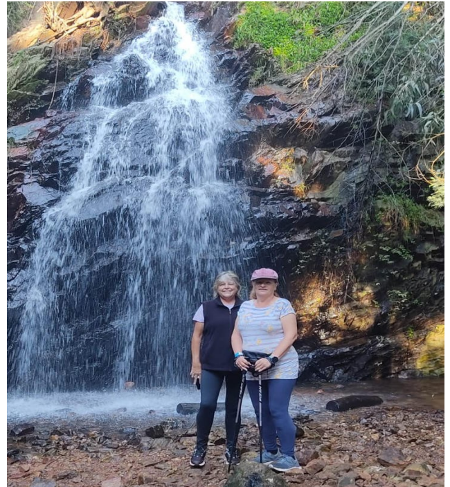
On our walking trail we came across a beautiful spring waterfall.