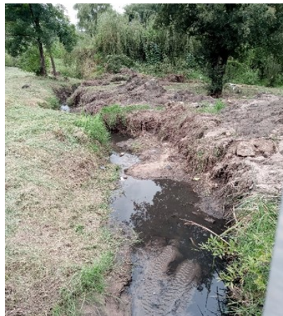
Water flowing in the cleared stream