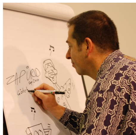
By Boberger. Photo: Bengt Oberger - Own work, CC BY 3.0, https://commons.wikimedia.org/w/index.php?curid=11646836